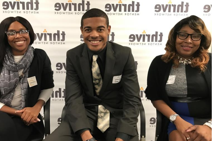
The College participates in a lot of entrepreneurship programming like THRIVE.