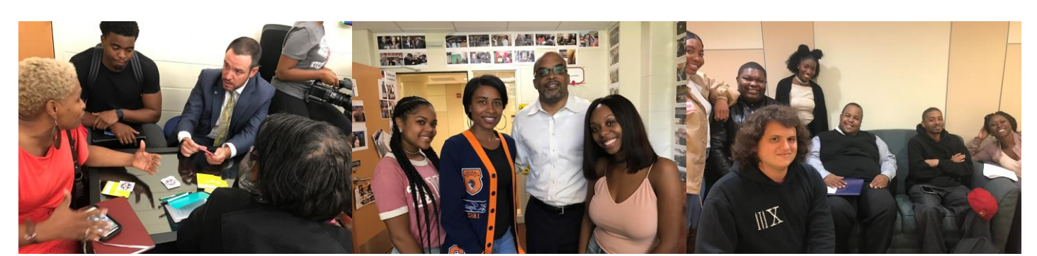
Center for Entrepreneurship in action.