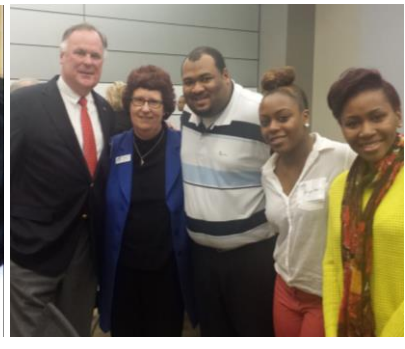
Networking at MeadWestvaco (MWV).