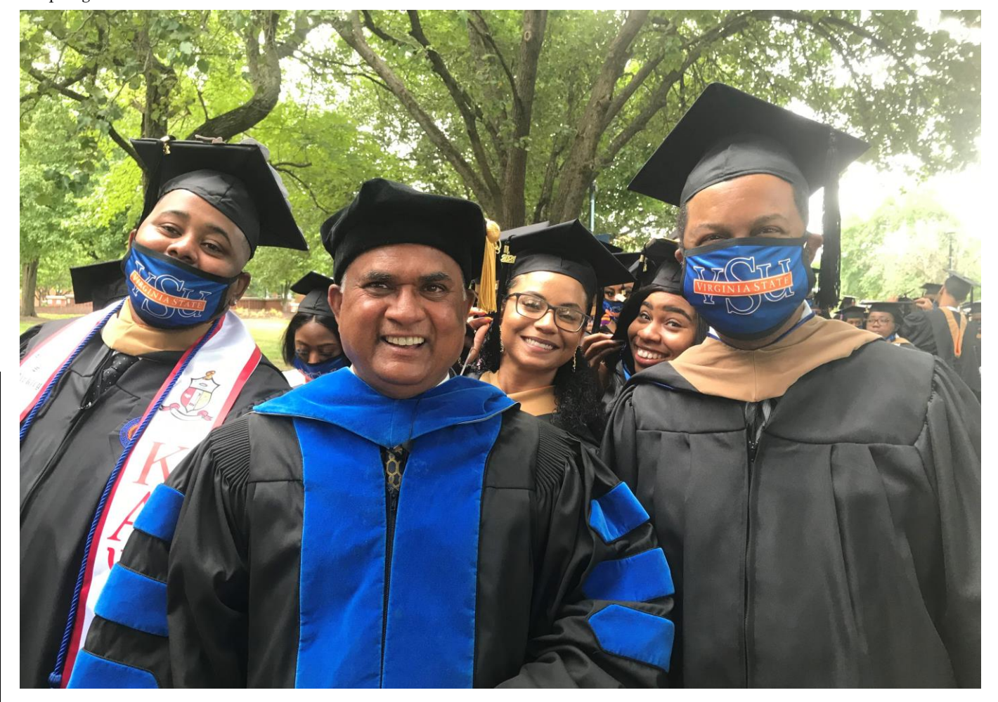
This newsletter is dedicated to all of our graduates who after a year of COVID were able to celebrate in person.